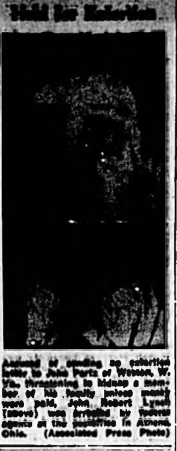
Announced as standing on committee...