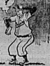
AFTER PITCHING THE CIRCLED 3 SUCCESSFUL INNINGS (1947 AND '48) HE SEEMED TO BE WASHED UP IN '45 WHEN HE COULDN'T STRAIGHTEN HIS ARM AFTER AN ELBOW OPERATION!