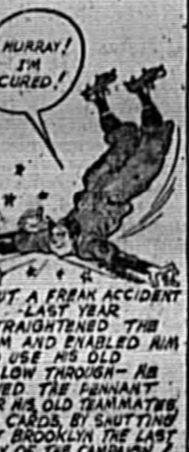
MURRAY: I'M CURED! BUT A FREAK ACCIDENT STRAIGHTENED THE ARM AND ENABLED HIM TO USE HIS OLD FOLLOW THROUGH—HE SAVED THE FENIAN FOR HIS OLD TEAMMATE FOR CARE BY SUTTING OUT BROOKLYN THE LAST DAY OF THE CAMPAIGN!