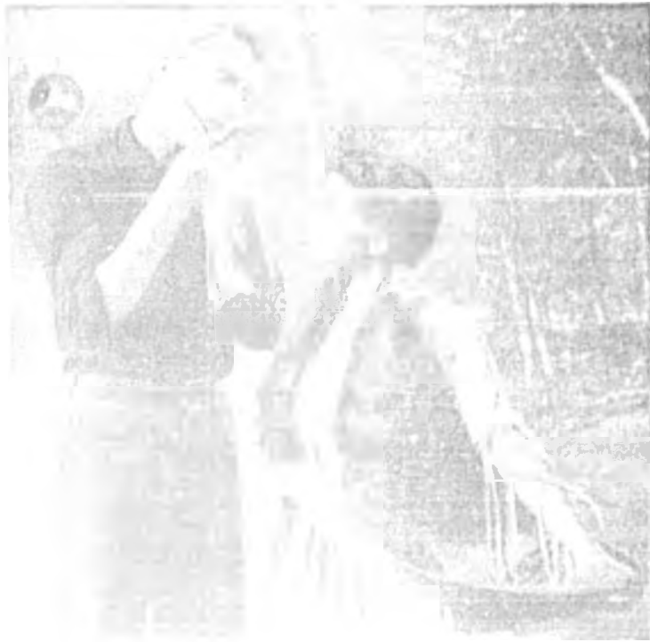
Children are encouraged to read at their own pace, according to a psychologist.