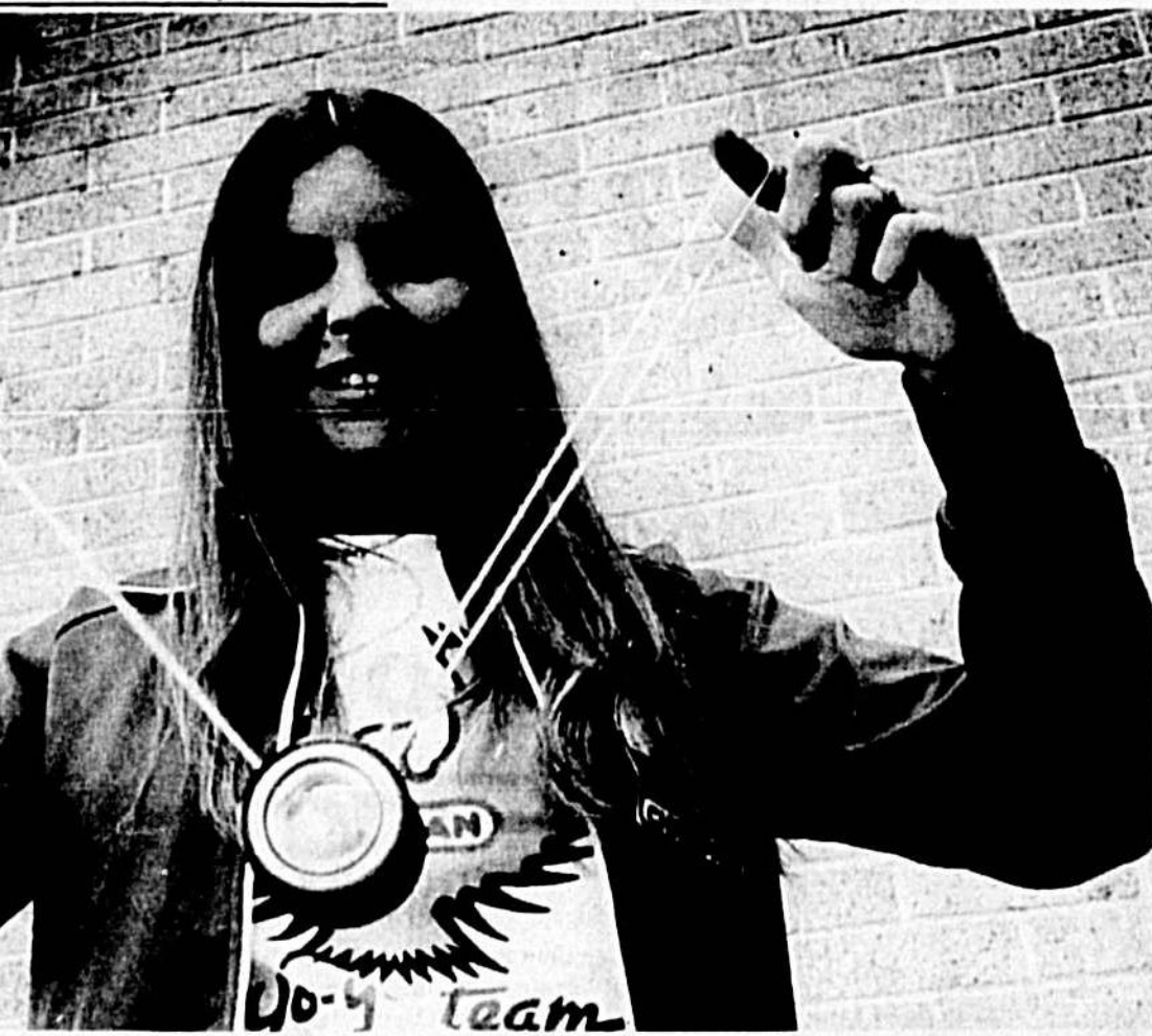
Children, winners of the Grand Championship...