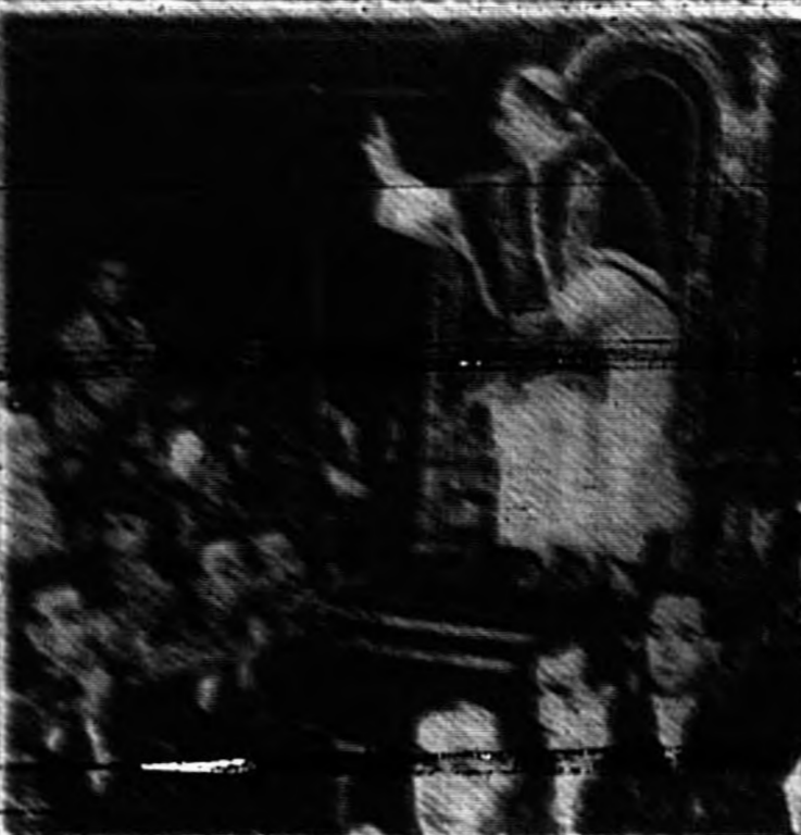
...the Japanese had been working to capture the island for a long time and that they had been working to capture the island for a long time. He said that the Japanese had been working to capture the island for a long time and that they had been working to capture the island for a long time.