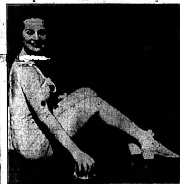
Eleanor Whitney, "tops" among the film 'top dancers, takes to a sea-going runabout—and so doesn't mind one bit when the sun beams down in a torrid manner at Santa Monica, Calif.