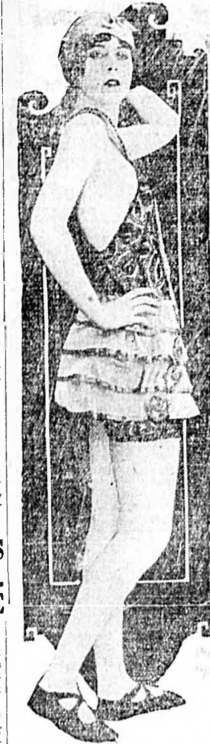
Here's a snappy bathing suit of black lace over tan satin with a flippant ruffled skirt of changeable blue and green taffeta.