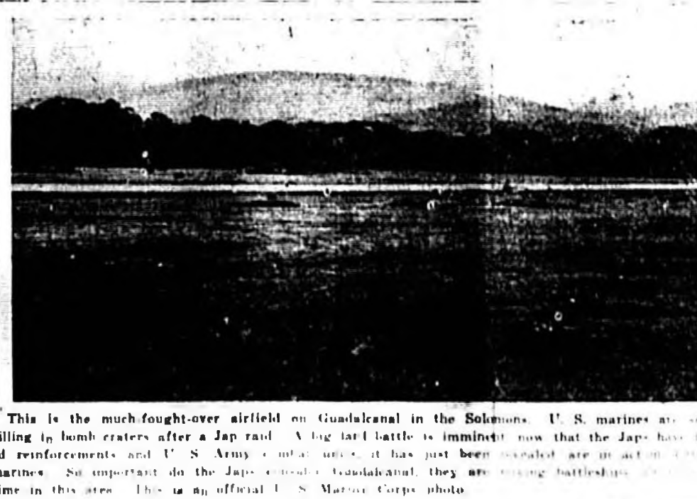
This is the much fought-over airfield on Guadalcanal in the Solomons. U. S. marines are filling in bomb craters after a Jap raid. A big land battle is imminent now that the Japs have had reinforcements and U. S. Army units are in action on the island. So important to the Japs is Guadalcanal, they are using battalions of their time in this area.