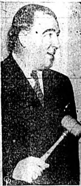
Rep. Jennings Randolph Rep. Jennings Randolph of W. Va. holds the gavel used in the House as the first session of the 77th Congress closes. The House, however, went into its second session after a short lapse, continuing its work on war legislation.