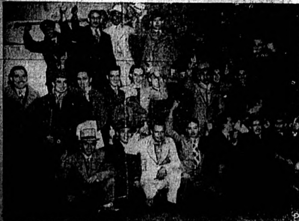
The first contingent of the 526 Latin-American youths coming to the United States for training as pilots, mechanical engineers and aviation mechanics arrives at an Atlantic coast port. They will be trained in the Aeronautics Administration schools as part of a hemispheric solidarity program financed by Federal funds. They are scholarship winners. They're making the "thumbs up" victory gesture.