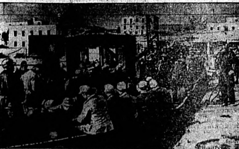
Nazi soldiers are shown in Tobruk, but not triumphantly. Captured in the great British offensive in Libya, these prisoners are aboard a lighter in the harbor, ready to be conveyed through the Mediterranean to a secluded spot for the duration.