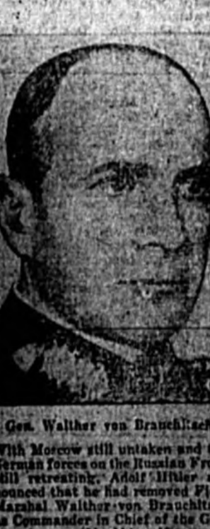
Gen. Walther von Brauchitsch is shown with Morocow still untraken and the German forces on the Russian front still retreating. Adolf Hitler announced that he had removed Field Marshal Walther von Brauchitsch as Commander in Chief of the German Army and had himself assumed the post so that he could direct personally all military operations.