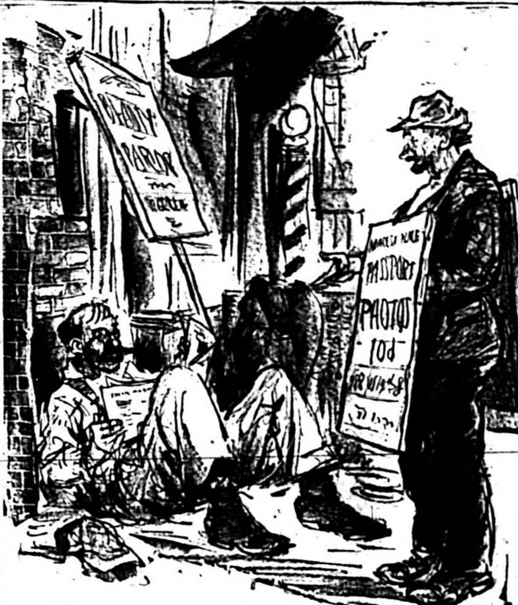
It wasn't fair. As soon as he saw that one with the baby face he didn't even know much experience she'd had.