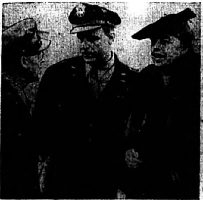
Mrs. Eleanor Roosevelt found time in her crowded itinerary to pay a visit to a U. S. Army Air Force station somewhere in England to meet her son Lieut. Col. Elliott Roosevelt. The unidentified officer (left) was her escort. Elliott is now in Africa under Gen. Eisenhower.