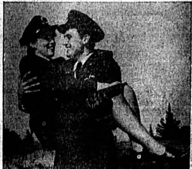
DIANA BARRYMORE and Robert Stack have leading romantic and dramatic roles in Walter Wanger's Universal production of "EAGLE SQUADRON," story of U. S. fighter pilots in the RAF, coming to the RITZ THEATER next Sunday and Monday.