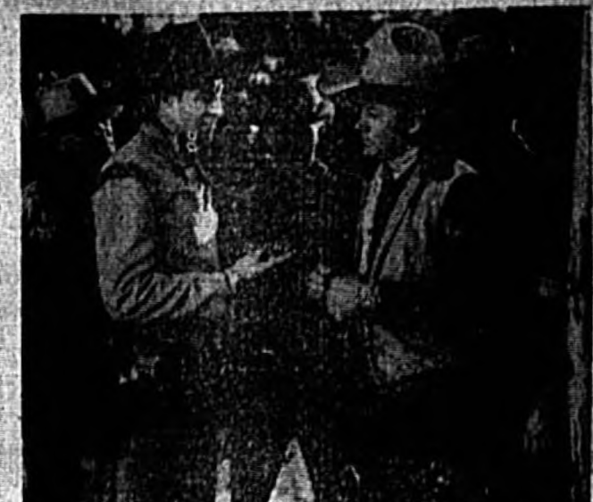
Bill Elliott and Tex Ritter discuss their plans for a raid on an outlaw gang in "PRAIRIE GUNSMOKE," thrilling Western Photo-play, showing today and Saturday at the local RITZ THEATER.

Washington's government is looking for a name to be appointed by the President to three-year terms at $40,000 annually. The total population of India is 285,000,000. There are 24 languages spoken in that country.