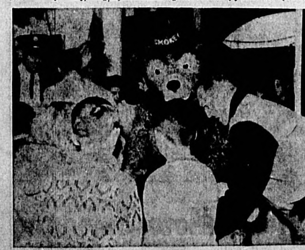
CENTER OF ATTRACTION at Sunday's North Orlando Holiday Party was "Smokey the Bear" who kept the youngsters (and adults) entertained throughout the afternoon with his good humored antics.

Adults were served refreshments and Santa gave each child favors of red, green or blue Christmas tree ornaments, plastic cans filled with candy and tangerines.