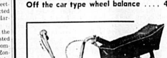
Off the car type wheel balance... 4 for $7

NORTH ORLANDO—Village Council approved recommendations of the Planning and Zoning Board to amend the Ordinance establishing districts.