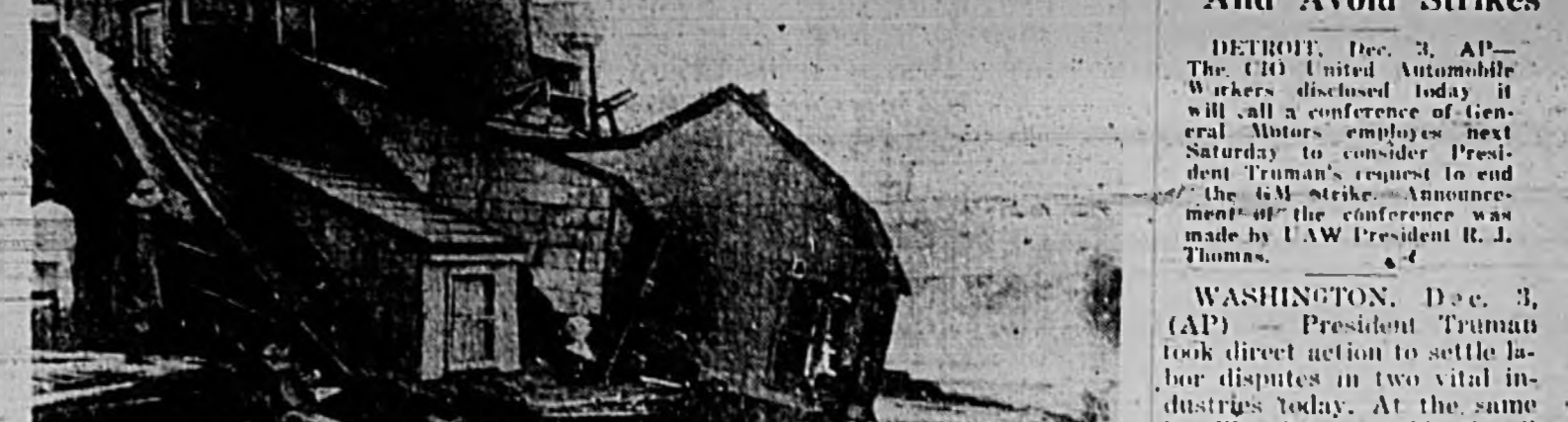
TUMBLING INTO THE ROUGH SURF as though they were made of paper mache, these houses in Whitport, Mass., emphatically illustrate the fury of the Northeastern typhoon that lashed the coast. The great concrete slabs in the foreground were torn up by the roaring waters and tumbled back like driftwood. The storm left in its wake at least thirty-four dead, numerous injured, and considerable property damage.

As Howling Storm Lashed Eastern Seaboard