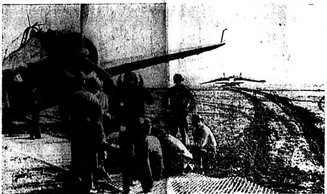
This muddy airport at Saff, French Morocco, captured by U.S. troops when they invaded Africa, made the going tough for American pilots. Members of the U. S. Air Force are laying a metal strip for the take-off of the torpedo bomber in the foreground. A navy dive bomber took off from the strip in the background.