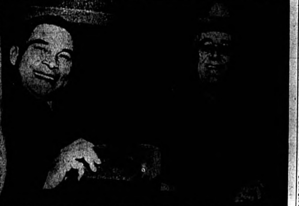
STILL AT IT President Roosevelt is seated in his car with the chief executive of Cuba, President Fulgencio Batista...