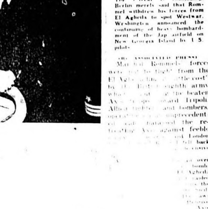
Director of USO Addresses Rotary Club At Meeting