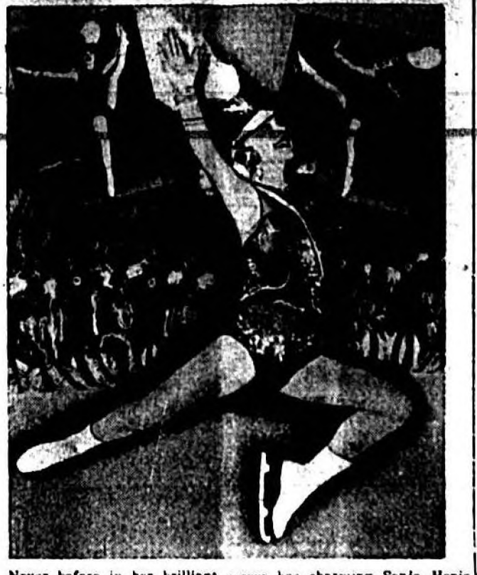
Never before in her brilliant career has charming Sonja Henie performed such breath-taking swirls and spins on ice as she does in her latest screen hit, 20th Century Fox's gay new musical, "Ice-land," coming to the Rita Theatre Sunday and Monday. Sonja dances her way into the heart of co-star John Payne, when he lands in her native Iceland. Jack Oakie and Sammy Kaye and his Orchestra are featured in the film.