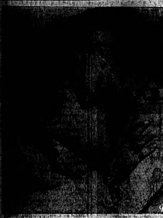
Among the first pictures to reach the outside world since the Nazi conquest of Poland, these photos tell the story of Nazi administration of occupied Poland. German soldiers after the invasion shot 100 Poles in the forests. In every German-occupied town, the Germans set up a Gestapo office. In Warsaw, the Germans have been in possession of a weapon.