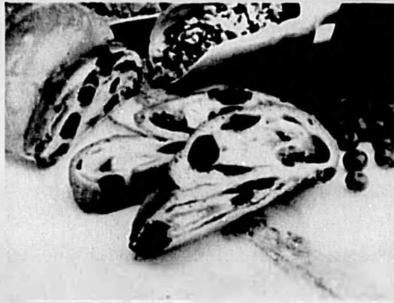
Low-fat Blueberry Twist