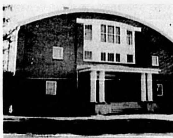
National Guard Armory