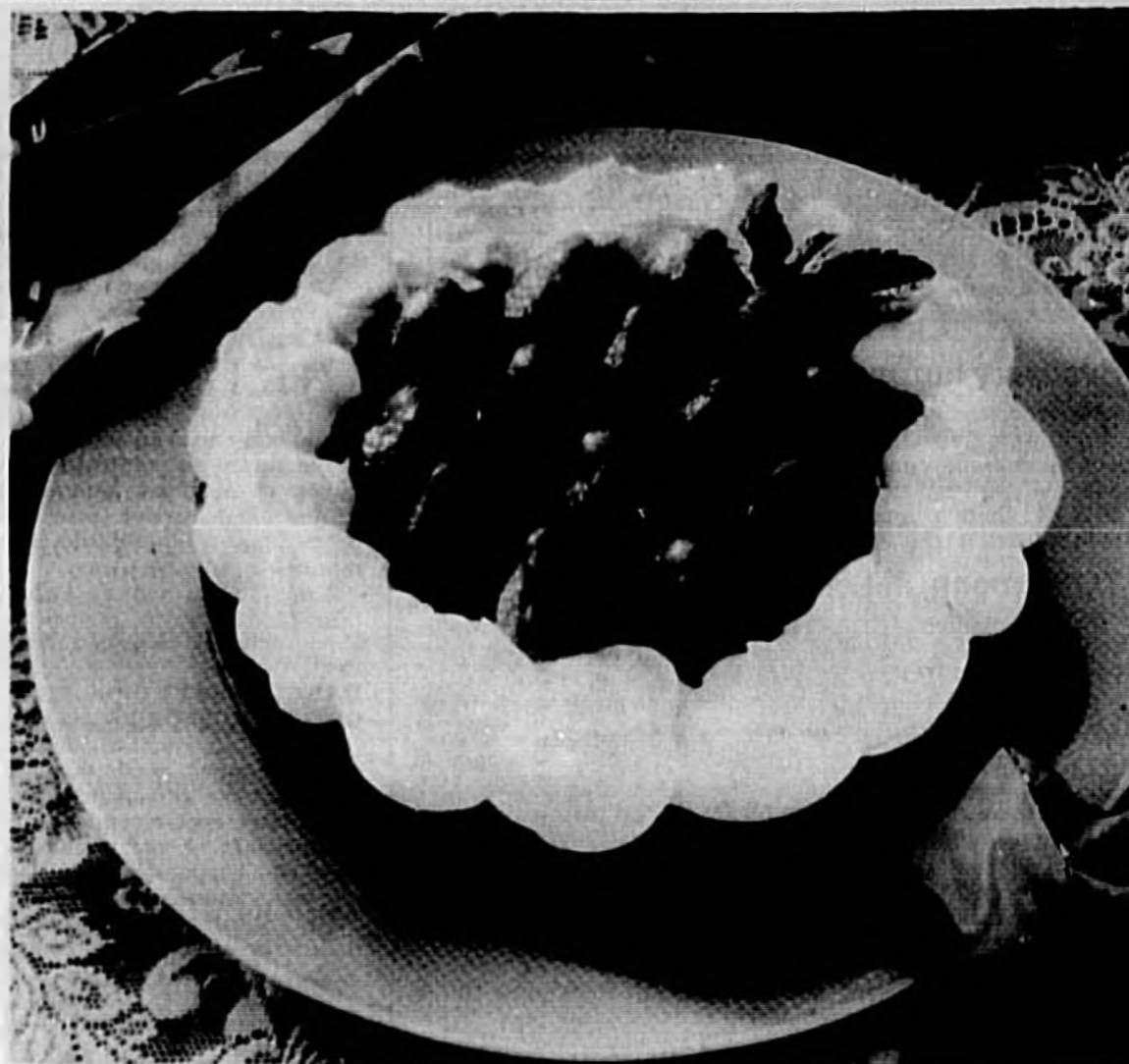
Strawberry Devonshire Tart will make your family and guests stand up and take notice.

Refrigerate until ready to serve. Makes 8 servings.