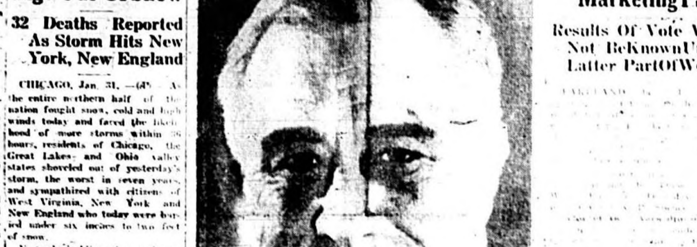
Smiles appreciation for the many who have helped in the fight against the flu. The man in the photo is a member of the local health committee.