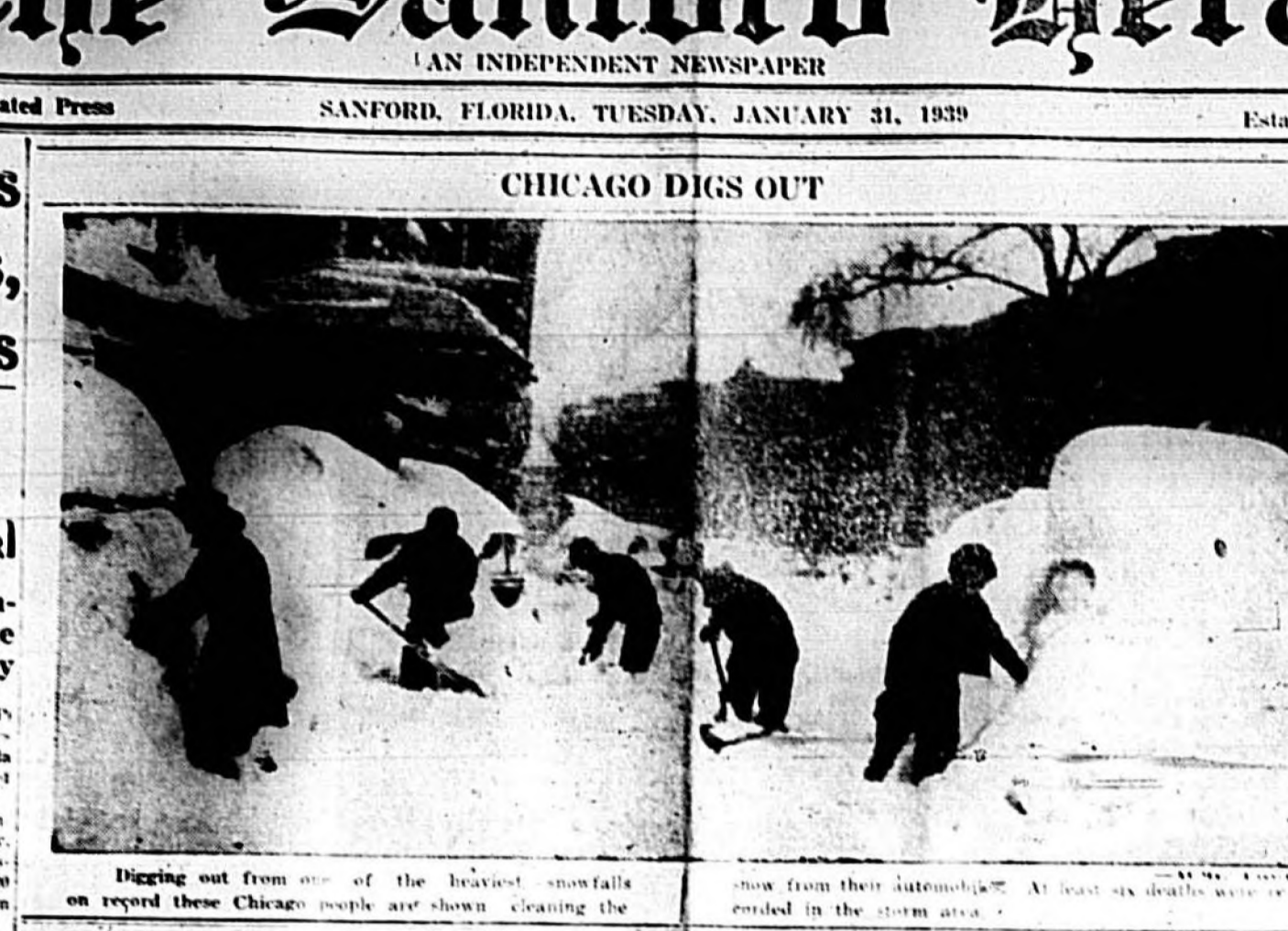
Digging out from one of the heaviest snowfalls on record these Chicago people are shown clearing the snow from their latitudes. At least six deaths were reported.