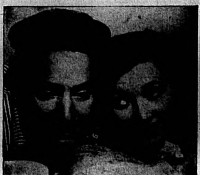
PATSY KELLY and Alan Mowbray as a comedy romance team in the Hal Roach production "There Goes My Heart" opening Wednesday at the Ritz.

A surgeon who sewed up his instruments inside a patient has nothing on a North Carolina automobile mechanic who left his wrench inside a tire he repaired.