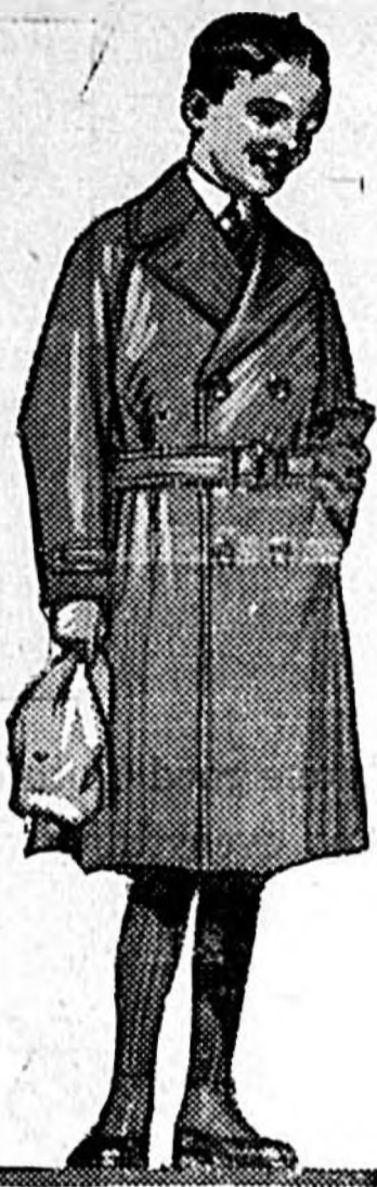
Copyright 1921 Hart Schaffner & Marx

Give the Boy an Overcoat We have a good stock of Overcoats and Suits for Boys