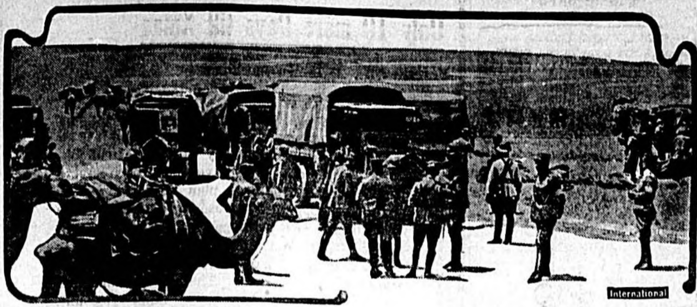
Camels and motor trucks afford an odd contrast in this photograph which shows the headquarters' train of the Greek forces in Asia Minor, preparing to leave the vicinity of Eski-Shehr in pursuit of the Turkish nationalists.