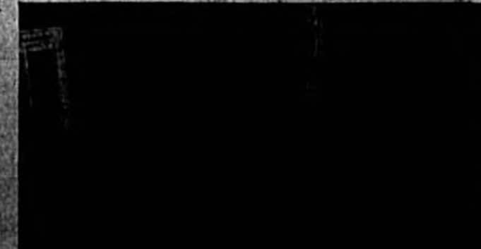
Portrait of a man Portrait of a man, likely related to the news item about the British and Free French forces.