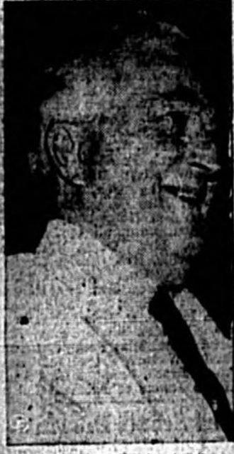
Gen. Fielesch Gen. Fielesch is commander of the Norwegian troops in Great Britain. He is reported ready for any action in Norway, where revolts against the Nazi rule are said to have reached serious proportions.