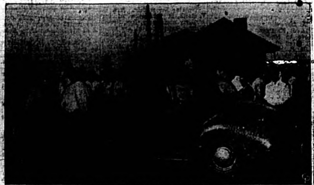
One picket holds up his hand while others surround one of men seeking to drive into the Federal Shipbuilding Yard at Kearny, N. J. Walkout of 18,000 CIO men brought halt to work on two cruisers and single destroyers. Direct government intervention was threatened when negotiations stalled.