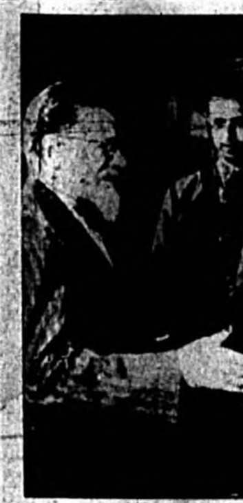
Mikhail I. Kalinin, president of the Soviet Union, commends five heroic Russian fliers who received medals for exemplary fighting against the invading Germans. This photo was flashed by radio from Moscow to New York.