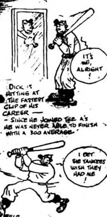
DICK SIEBERT FIRST BASE STAR OF THE IMPROVED PHILADELPHIA ATHLETICS