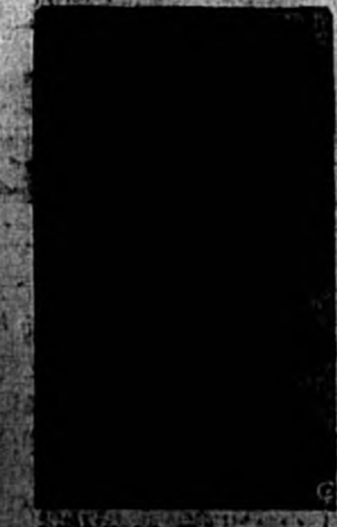
Portrait of a man Portrait of a man, likely related to the news item about the British and Free French forces.