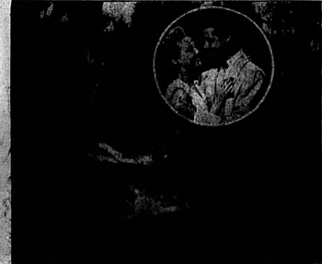
Florida's Beauty Shown in Technicolor in "Moon Over Miami" Cypress Gardens, Fla.—The technicolor feature "Moon Over Miami" will be striking advertisement for the state and above is shown one of the scenes made in Cypress Gardens where Robert Cummings and Betty Grable slide up on shore after an outboard "steepie chase" in which they try to escape from Don Ameche.