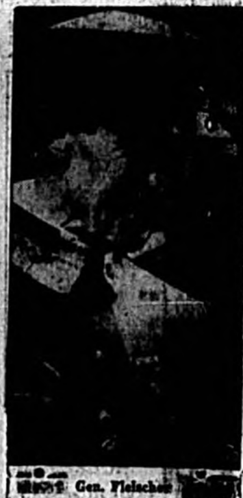
Gen. Fielesch Gen. Fielesch is commander of the Norwegian troops in Great Britain. He is reported ready for any action in Norway, where revolts against the Nazi rule are said to have reached serious proportions.