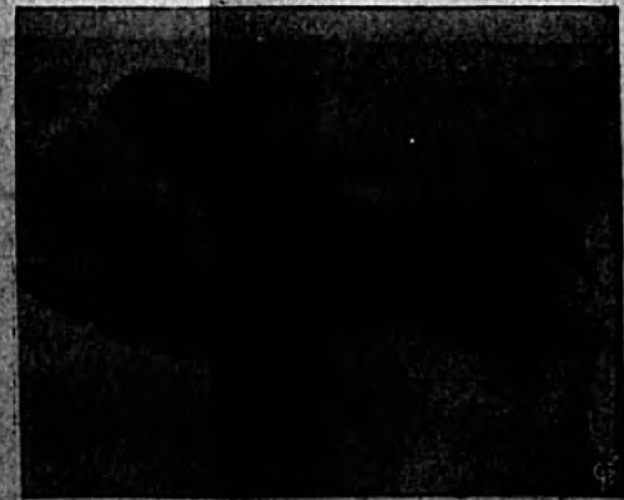
Portrait of a man Portrait of a man, likely related to the news item about the British and Free French forces.