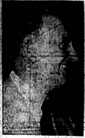
Henry Morgenthau, Jr. Secretary of the Treasury Henry Morgenthau, Jr., is shown as he appeared before the Senate Finance Committee and urged restoration of the $300,000,000 cut from the tax bill by the House. He called for broadening the income tax base by lowering exemptions on small wage earners.