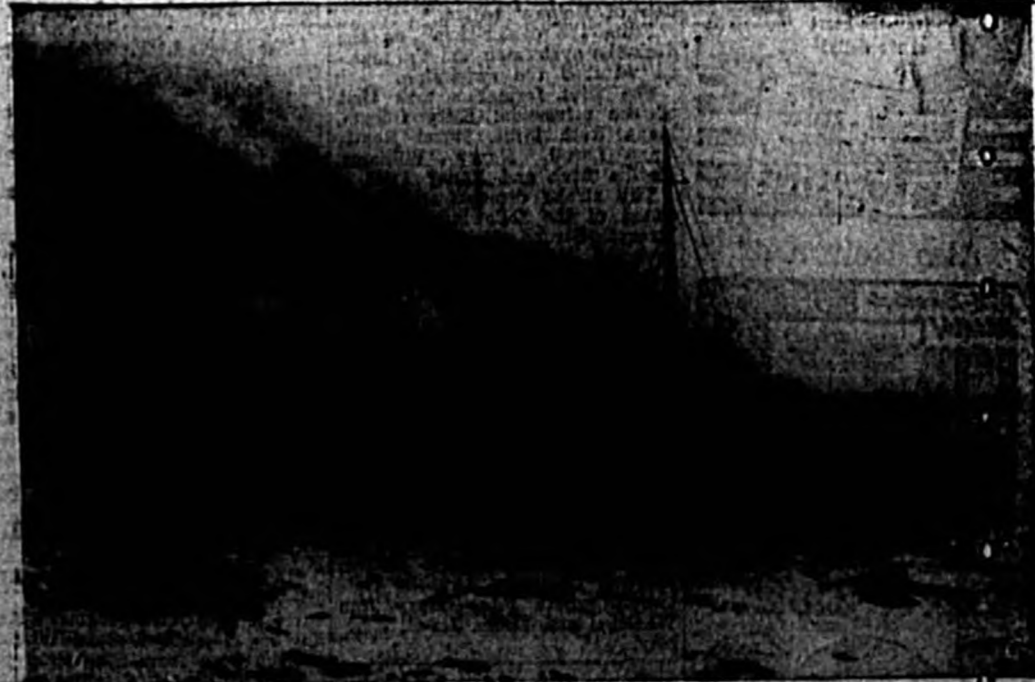
Not all ships such in the North Atlantic are British, as shown in this photo of a Nazi vessel with crew members by a ship of the Royal Navy. British captain says "Crew followed the usual procedure and dressed their ship." A British boat (left) flying the white ensign, stands by as the Nazi captain dresses his ship.