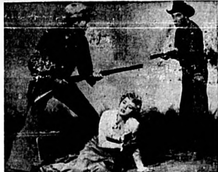
Scene from "Winchester 73", starring Shelly Winters, James Stewart, Dan Duryea and Stephen McNally showing Sunday and Monday at the Movieland Drive-In Theater.