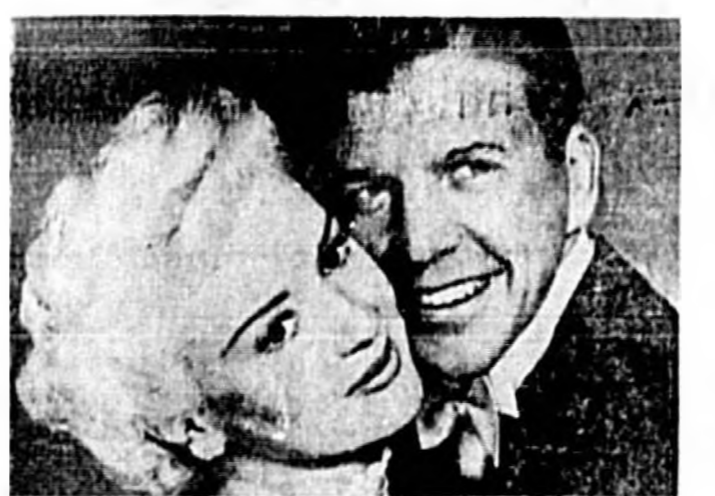
Betty Grable and Dan Dailey in a happy, intimate moment from 20th Century-Fox's "My Blue Heaven," in color by Technicolor, showing Sunday and Monday on the Ritz screen.