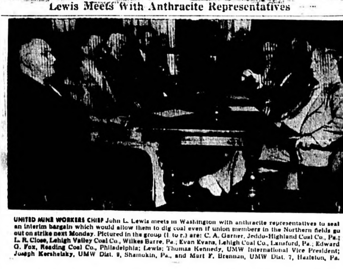
Lewis Meets With Anthracite Representatives UNITED MINE WORKERS CHIEF John L. Lewis meets in Washington with anthracite representatives to seal an interim bargain...