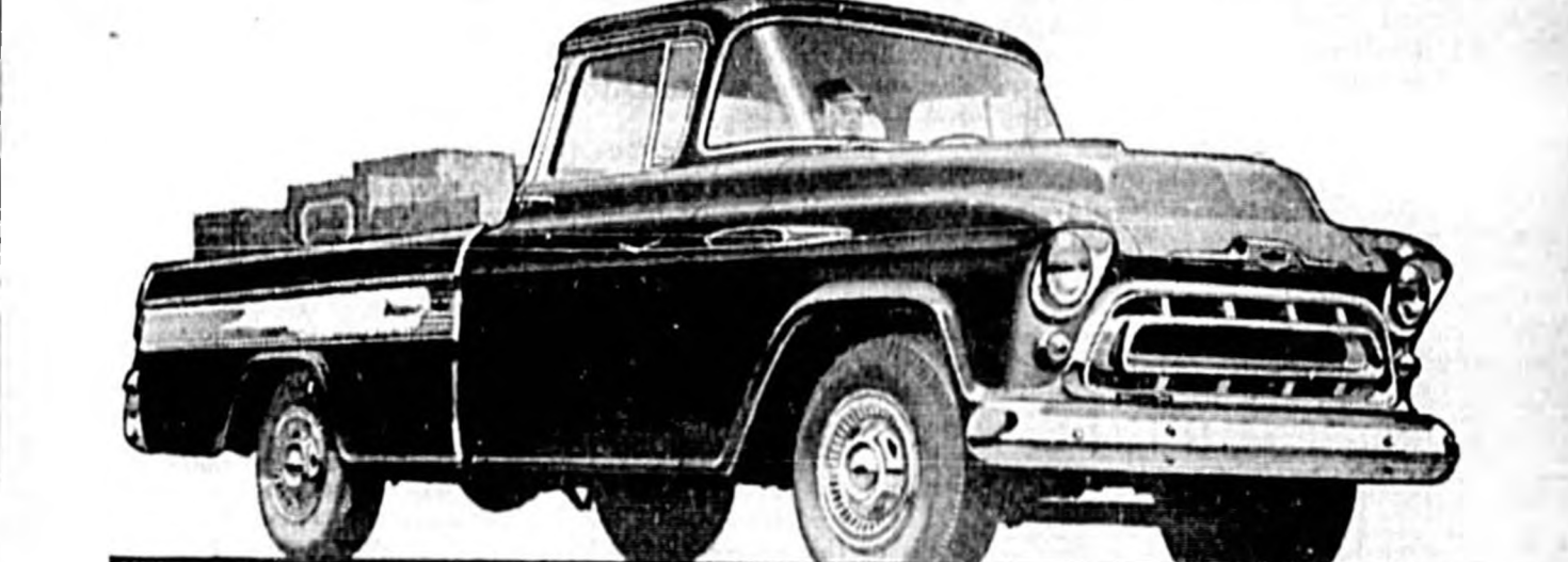
Brimmy liberally (that means how to work — the High Style of Chevy Carriers)

Hard-working pickups that know how to save... both Chevies