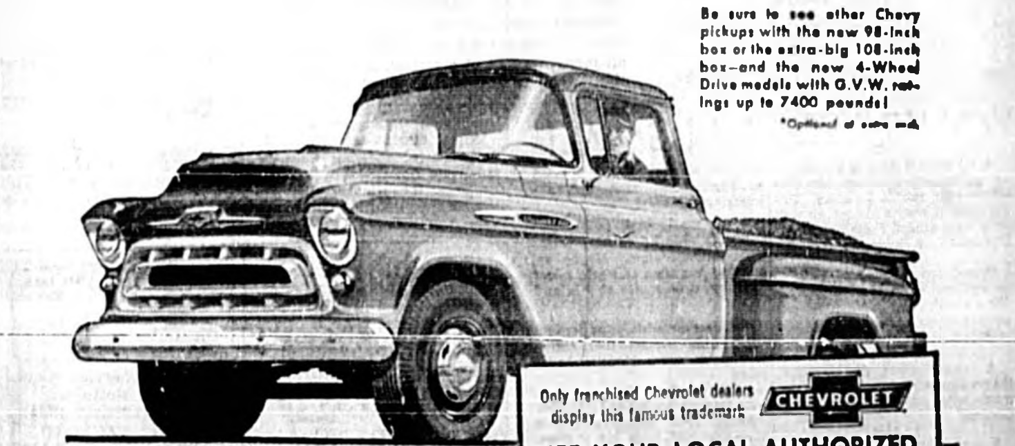
Here's the most popular pickup in America!

Hard-working pickups that know how to save... both Chevies