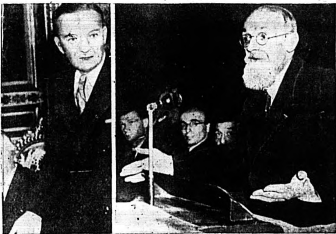
IT APPEARS THAT THE COMMUNIST PARTY IN FRANCE won a huge seat lead over its nearest rival, the Popular Republican Movement (MRP), in the nationwide election of deputies to the Fourth Republic's first National Assembly. Francisque Gay (right), leader of the Popular Republican Movement (MRP), is pictured as he addressed a group during the campaign. Provisional President of France Georges Bidault (left), is shown as he presided at the opening session of the National Press Conference in Paris. (International)