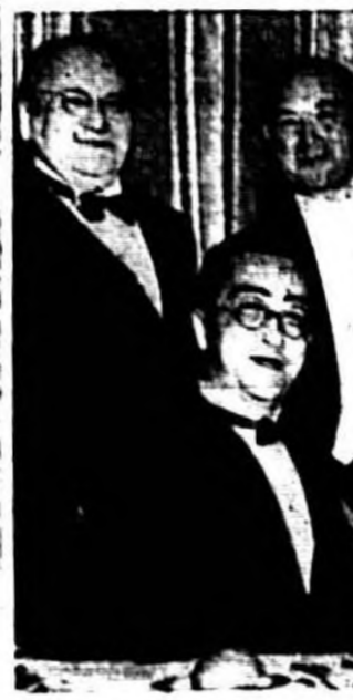
Shown at the Economic Club luncheon in New York are Dr. Hu Shih (center), Chinese ambassador to the U. S., Maxim Litvinov (right), Russian ambassador, and David Sarnoff, president of the Radio City Building. They are speaking for greater unity among the nations fighting the Axis. Litvinov asked for an immediate offensive against the Nazis as supreme strategy against the common foe.