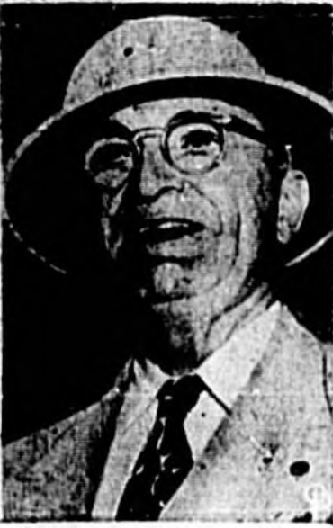
PRES. HARRY S. TRUMAN

MAKING THEIR ANNOUNCEMENTS on the same day, Gen. Douglas MacArthur (left) and President Harry S. Truman (right) declared they would accept the Presidency.