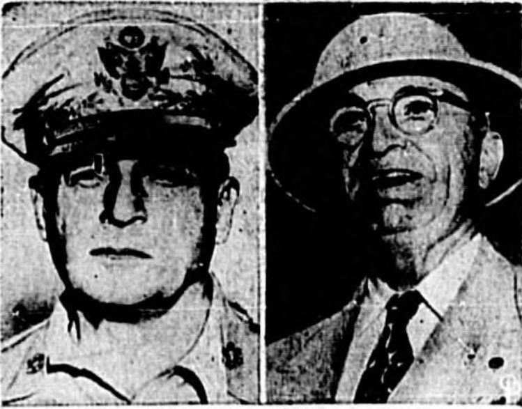
GEN. DOUGLAS MACARTHUR

County commissioners, following their session Tuesday accepted the invitation of Leonard Button to visit the site of a new road development running east from Seminole Drive at a point west of the Seminole Driving Track.