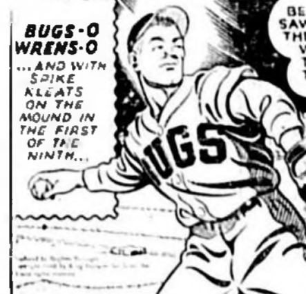
MICKEY MOUSE By Walt Disney