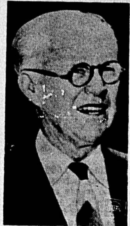
JOSEPH KENNEDY, 78, former U. S. ambassador to Great Britain and father of the late President, has been admitted to New England Baptist Hospital, Boston, for what was described as a medical check-up. He suffered a mild heart attack July 18 at his home in Hyannis Port, Mass.

Police told the court that the youth was "very intelligent" but turned to crime when the severe and constant pain of toothaches prevented him from keeping a job.