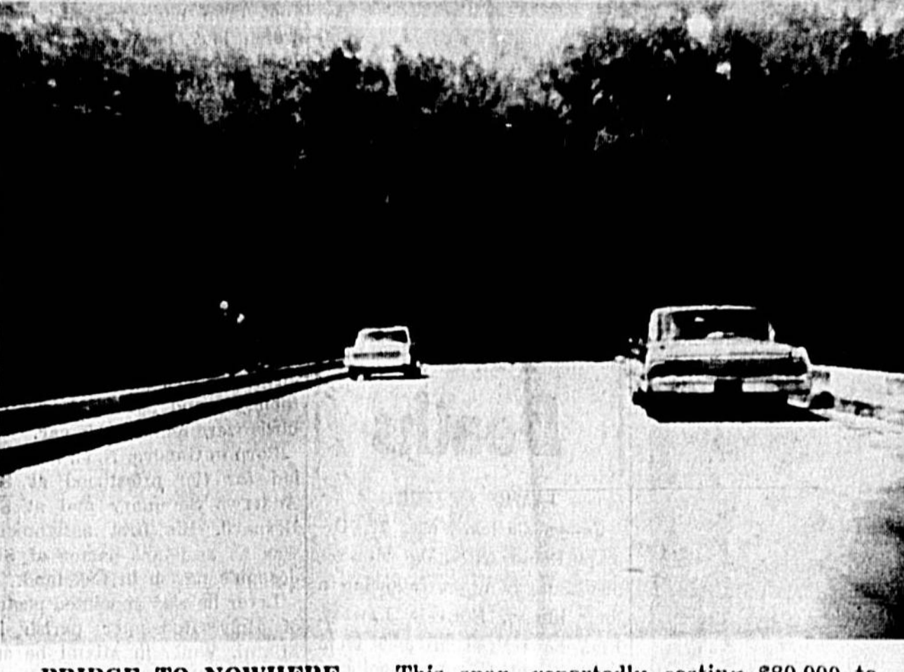
BRIDGE TO NOWHERE — This span, reportedly costing $80,000 to build 8-10 years ago, connects Seminole and Orange Counties, across the Wekiwa River.. only motorists hit a wall of trees and weeds at the Orange end of the bridge. Road across the bridge, so 'tis said, was to connect with a new dead-end highway running south from SH 46 in Lake County. Span was built with private capital. State study of a recreation park in the area has revived the thought of completing the road to connect Lake, Orange and Seminole Counties across the Wekiwa River.