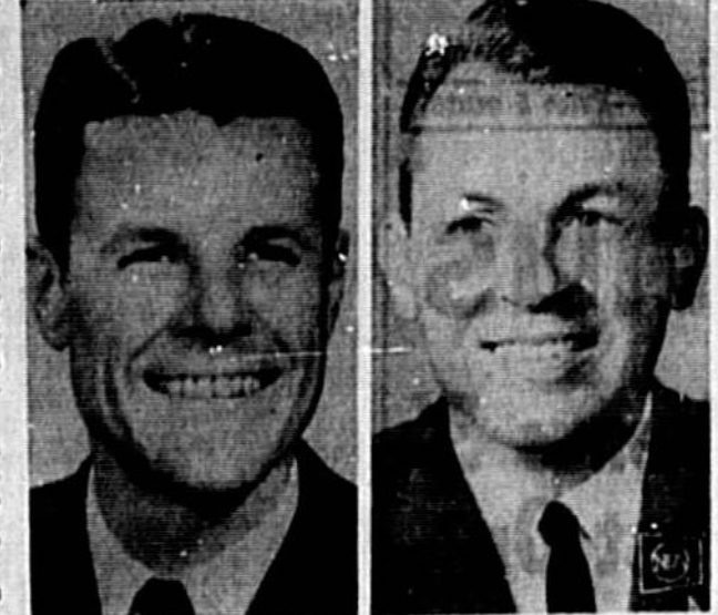
Astronauts Alan Shepard Jr. and Charles A. Bassett II. Both crash test pilots, were killed instantly Monday when their T-28 jet trainer crashed in rain and fog while attempting an instrument landing.

ST. LOUIS, Mo. (UPI) — Astronaut Alan Shepard Jr. today headed an investigation into the crash of a jet trainer which claimed the lives of two fellow astronauts scheduled to try America's longest "walk in space" this spring.