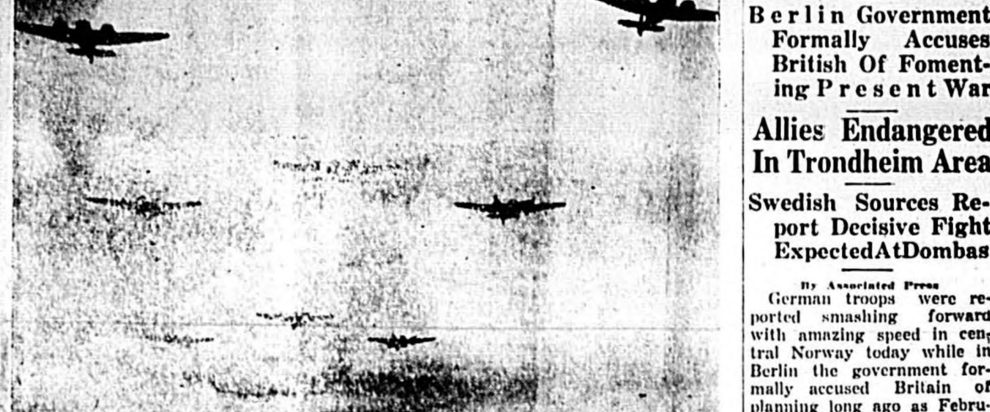
BRITISH AIRMADA SOARS NORTH INTO WAR CLOUDS. The British bombers were seen over the North Sea as they headed for the Continent.