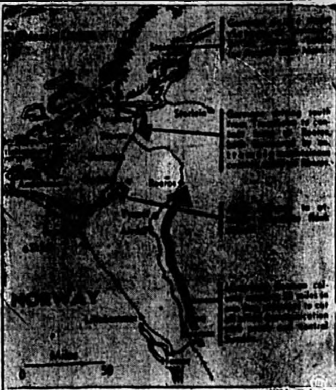
This map details developments in the fierce fighting between German and Allied troops in Norway. Currently the Allies seem to be getting the worst of it.