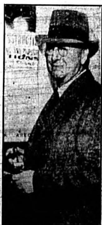
Col. Frank Knox, Chicago newspaper publisher, shown casting his vote, held a big lead over Senator William E. Borah of Idaho as returns rolled in from the Illinois Republican presidential primary.