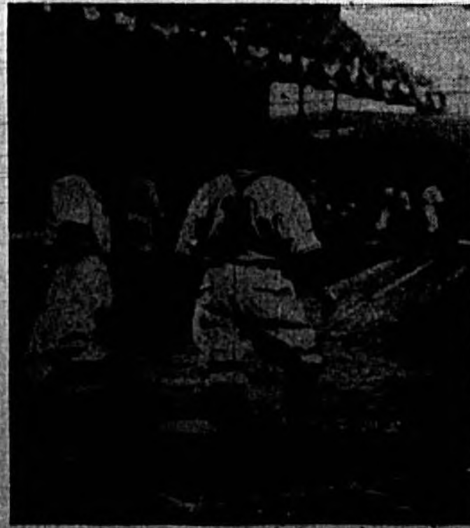
The world champion Detroit Tigers got off to a flying start by beating the Cleveland Indians 5 to 0 in the opening game at Cleveland. Mickey Cochran, the Tigers' catcher-manager, is shown leaving the first Detroit run.