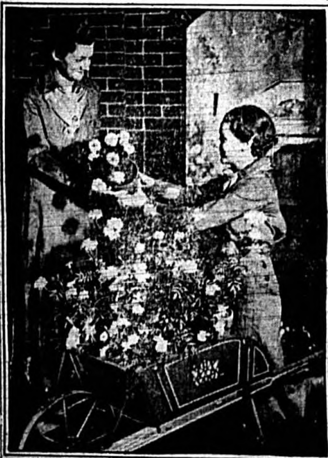
A barrowful of these marigolds is none too many for two Girl Scouts who want their gardens to glow with the new deep orange variety named Girl Scout Golden Eagle at the 23rd International Flower Show held in New York this spring.