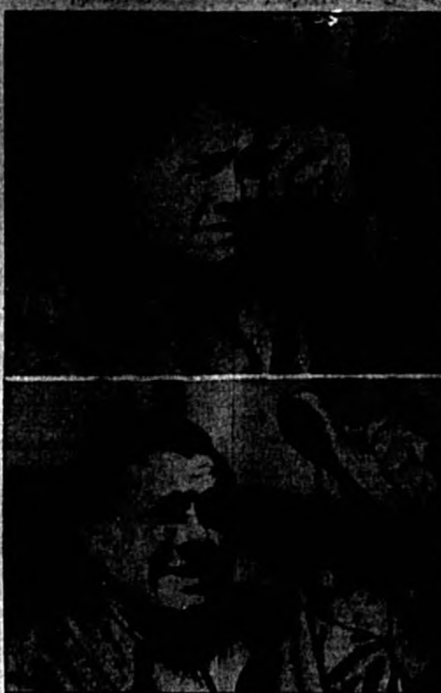
"Seems sort of funny not to be playing," Babe Ruth (top) probably was thinking when the candid cameraman caught him watching the New York Giants-Brooklyn Dodgers game at New York. Then the Bambino, missing his first season as a player in 32 years, became just another excited spectator (below) and cheered with the best of them.