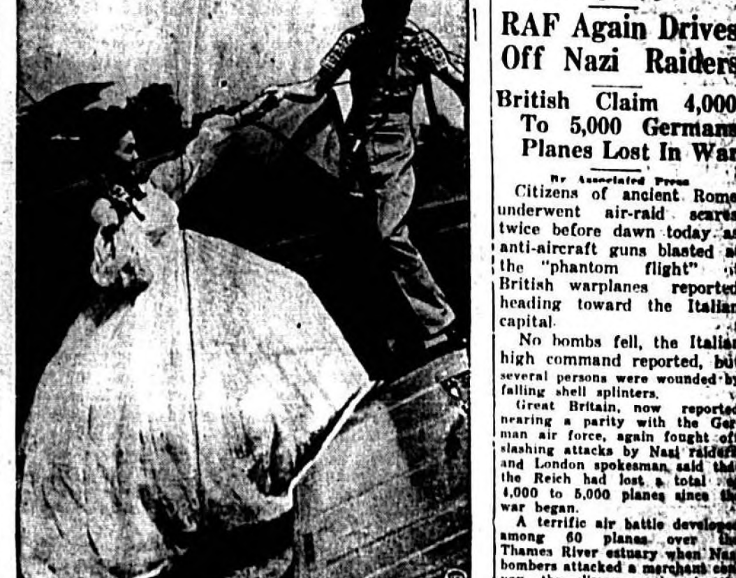
East meets West and yesterday's events today when girls go to the aviation school...

Two Reported Hurt By Anti-Aircraft Fire; British Flyers Fall To Drop Explosives