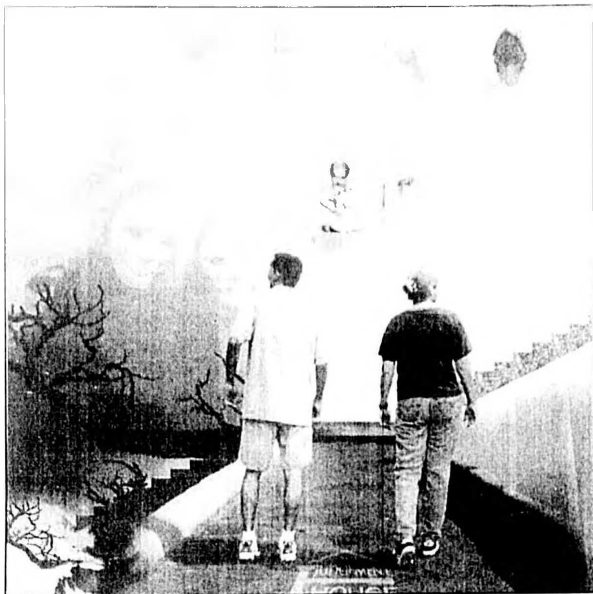
The church is distributing numerous flyers, such as this one, to promote 'Judgment House.'