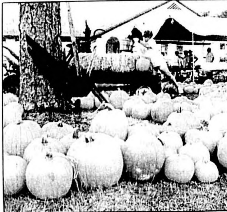
Pumpkins, cornstalks, bales of hay and gourds will be sold in the patch at the Casselberry church

on the grounds with pumpkins of all sizes for sale. For more information call the church office at 339-1266.