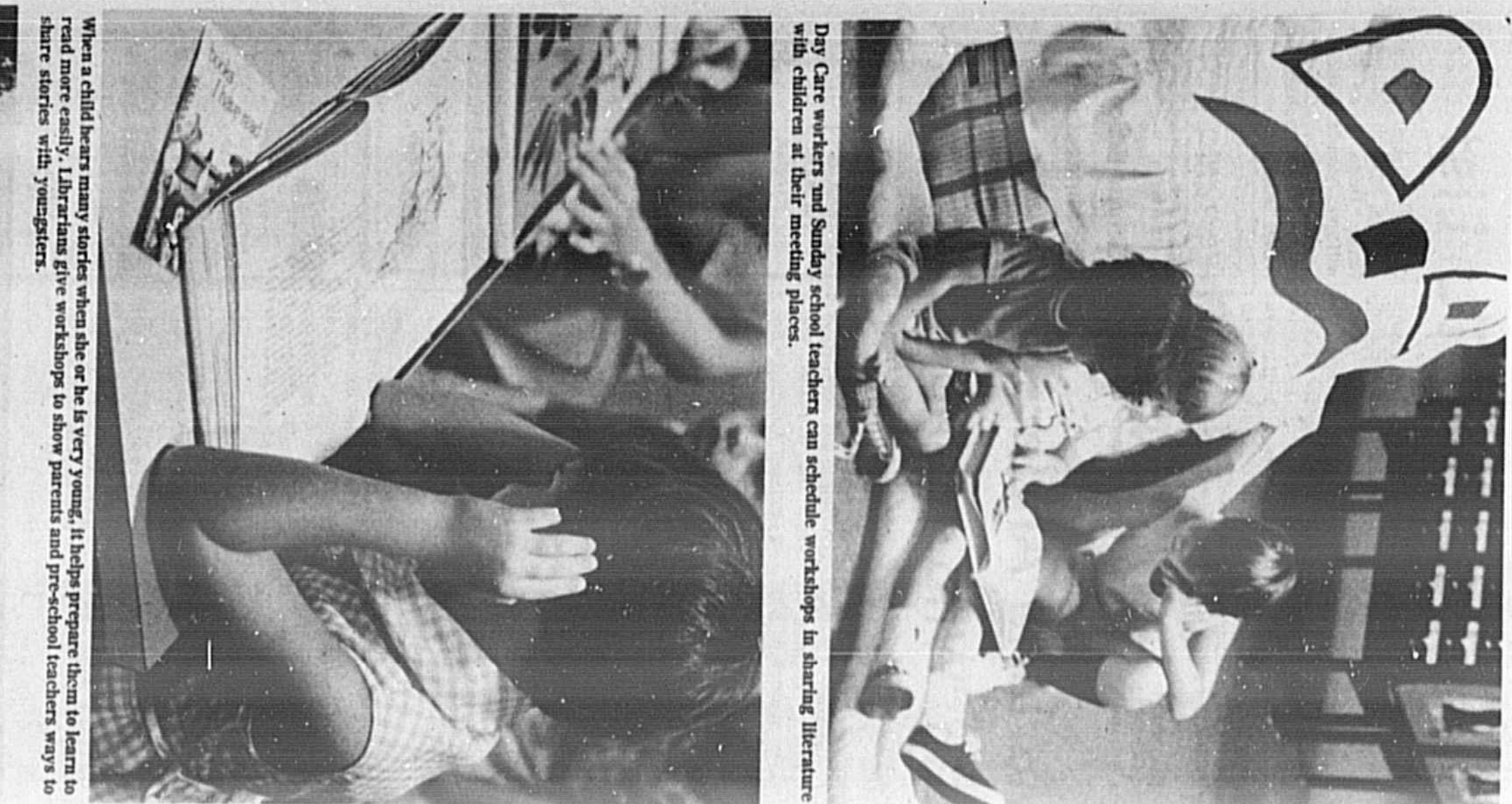
Day care workers and Sunday school teachers can schedule workshops in sharing literature with children at their meeting places.

What do you do when you get questions dealing with how to find a book or what to do when you find a book? The answer is to ask a librarian.