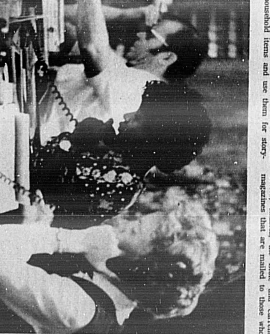
The new library services has operators ready to answer questions about the $45,000 or less.