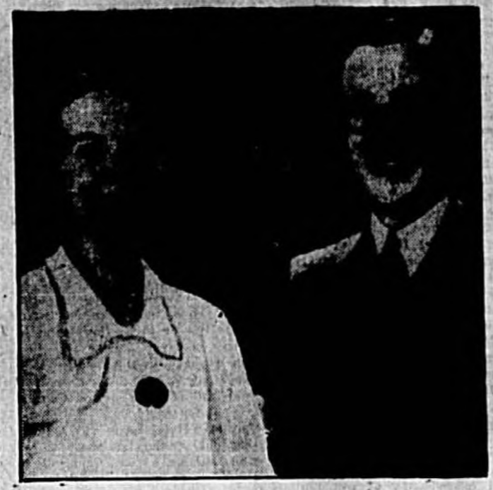
This official picture radioed from London to New York, shows Princess Juliana of The Netherlands with Prince Bernhard Zu Lippe-Biesterfeld, German nobleman whom she will wed. All Netherlands rejoiced in the engagement of the plump and jolly heiress to the throne.