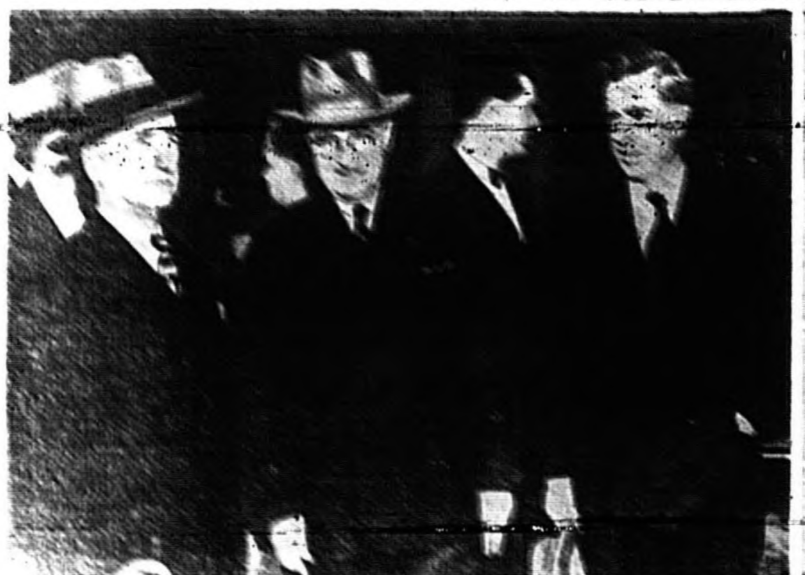
WAITING AT UNION STATION for the arrival of the body of the late President Roosevelt are (left to right) Foreign War Mobilization Agency Director, President Harry S. Truman and Secretary of Commerce Henry L. Wallace