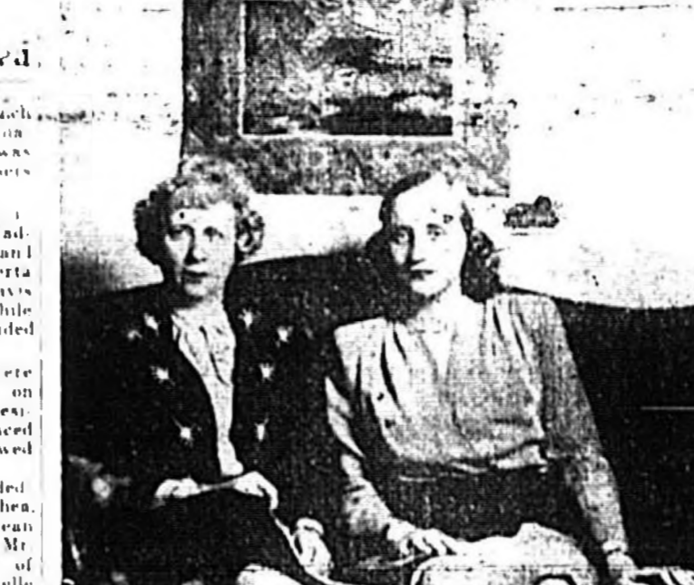
HERE IS 400 MOST EFFICIENT FOREIGN TO BE MADE OF THE NEW FIRST LADY OF THE UNITED STATES, MRS. HARRY S. THURMAN, AND HER DAUGHTER, MARGARET, THE PRINCESS WAS TAKEN IN THEIR WASHINGTON, D. C. APARTMENT INTERNATIONAL.