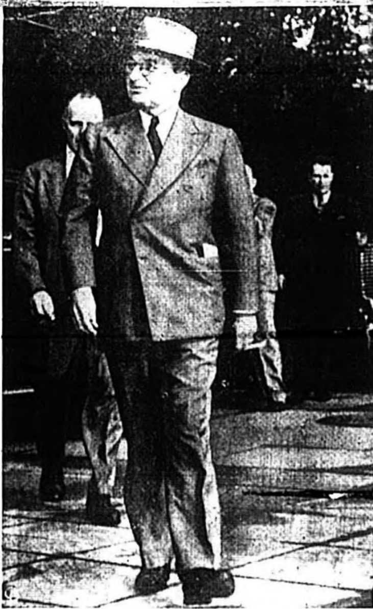
HARRY S. TRUMAN, shown as he walked to the White House Friday for the first time as President of the United States. The new President, who took the oath of office at 12:05 p. m. upon the death of Franklin D. Roosevelt, is seen here in a special car en route to the White House.