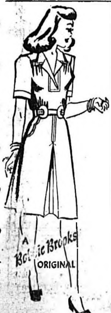
Bobbie Brooks ORIGINAL

Active interest in women's good music from different nations were given by the hostesses. (Continued on page 10.)