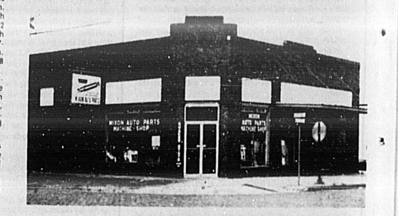
POPULAR DOWNTOWN LOCATION Two convenient locations to serve you. Pictured above, 3rd. & Magnolia. Also 17-92 Sanford.

Customer convenience and satisfaction — these are the main factors in the continuing popularity of Mixon Auto Parts stores. The entire organization is built around these two ideas. First, for convenience there are two stores, one at 3rd and Magnolia in downtown Sanford, and the other at 3159 Hwy. 17-92 serving the south Sanford area. Next, the hours are arranged for customer convenience. The downtown store is open 8 a.m. to 6 p.m. Monday through Saturday, and from 9 a.m. to 2 p.m. on Sunday. Try to match those hours elsewhere. The 17-92 store is open 8 a.m. to 6 p.m. Monday through Friday and 8 a.m. to 4 p.m. Saturday. For the convenience of do-it-yourselfers the downtown store has a machine shop, bring in your parts and Gerald Flynn, who has over 10 years experience as a machinist, will give you an expert job. Consumer satisfaction is obtained by offering a complete line of quality name brand parts at reasonable prices, courteous, competent and speedy personnel and guaranteed service.