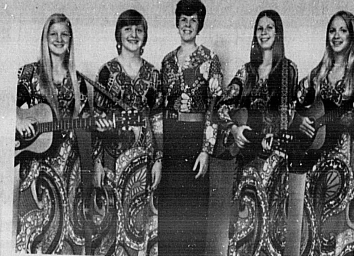
Four Teenage girls from Orangeburg, S.C., make up the The Believers singing group which will present a program of song and testimony Thursday at 8 p.m. at Elder Springs Baptist Church.

Female thief grabbed $210 Monday from cashier at Chase & Company of 2nd Street and Oak Avenue.