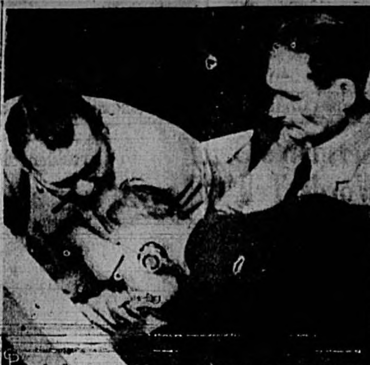
A COUPLE OF THE TOP-RANKING NAZIS on trial at Nuremberg, Germany, get together for a gab-fest during a recess. Ex-Marshal Hermann Goerring leans over to confer with ex-Foreign Minister Joachim Von Ribbentrop. The disinterested third party in the middle is Rudolf Hess, who recently decided to forget "forgetting."