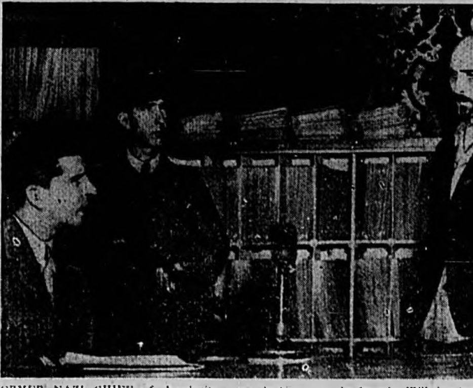
FORMER NAZI CHIEF of Auschwitz concentration camp in Austria, Wilhelm Grabner stands before the muzzle of a loaded rifle as he answered questions in Vienna and admitted killing a million persons in his torture-pens.

Supreme Court Gives Yamashita Execution Delay