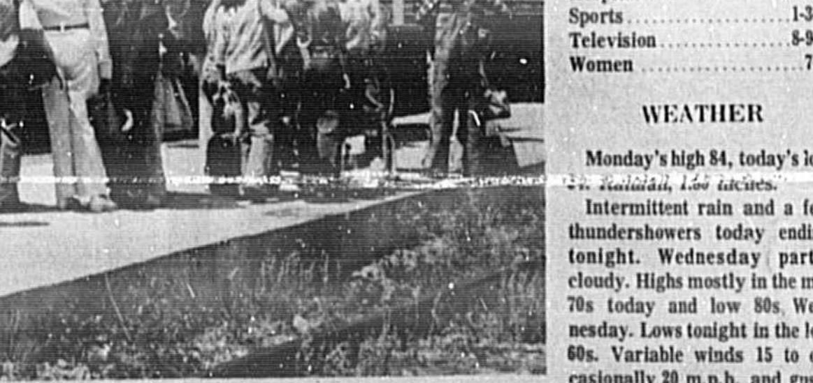
ALL ABOARD FOR VIRGINIA Longwood Elementary School File and Drum Corps lines up to board the Amtrak train Sunday afternoon for a trip to Richmond.

"Hats Off to the Bicentennial" is the salute planned by the Greater Sanford Chamber of Commerce Wednesday.