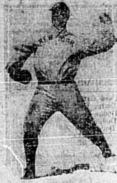
Presenting Lon Gehrig, hard-hitting recruit with the New York Yankees. Manager Huggins sees a coming star in the youngster, who is being groomed to take Rupp's place at first when the veteran shows signs of slipping and in addition is being touted as a successor to Babe Ruth as home-run monarch.