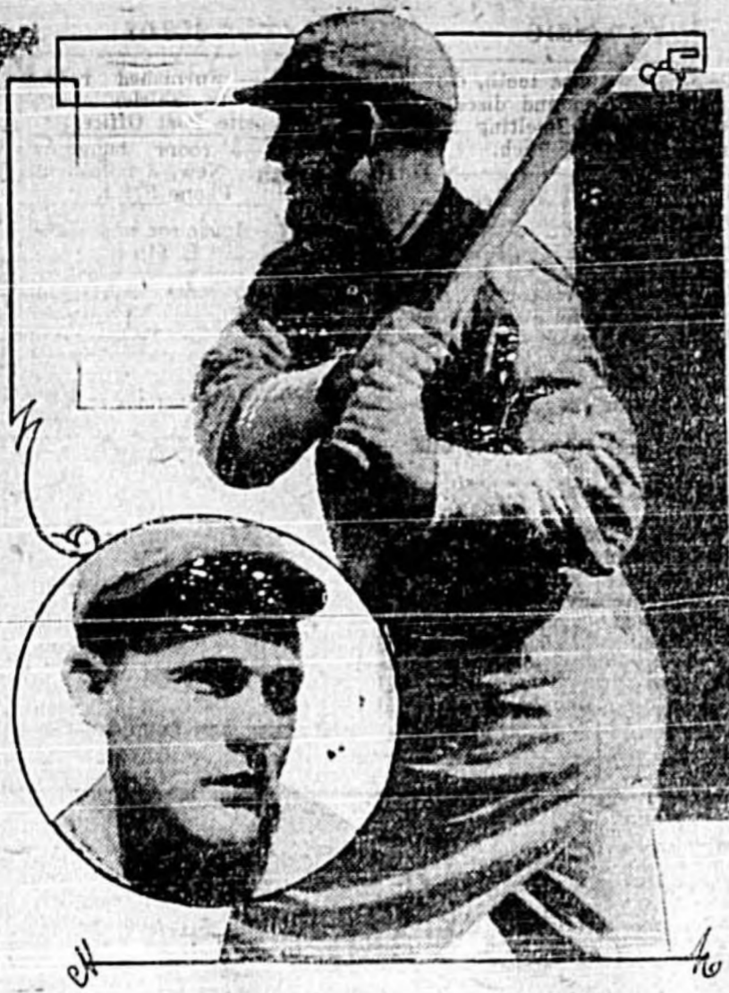
Here we have Rogers Hornsby, St. Louis Cardinals' star, and one of the best hitters baseball has produced. For the past five seasons Hornsby has led the National League in batting, establishing a new mark for modern play of .424 last year. Hornsby has two pet ambitions—one is to beat Ty Cobb's record of nine consecutive batting championships, and the other to excel Hughie Duffy's mark of .438, the game's highest hitting average. Photo shows closeup of Hornsby and in batting section.