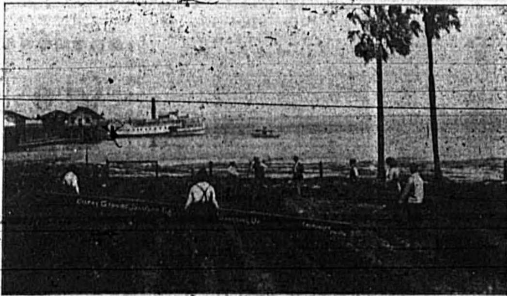
BOARDING CELERY, SANFORD, FLA.

It Makes No Difference What You Want or Where You Want It