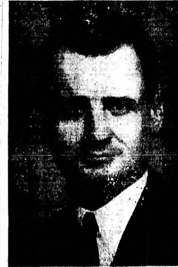
Rep. George Smathers of Miami was swept into Democratic nomination for U. S. senator yesterday by a landslide majority in a record turnout of voters from all over the state, his opponent Senator Claude Pepper conceding defeat shortly after midnight.