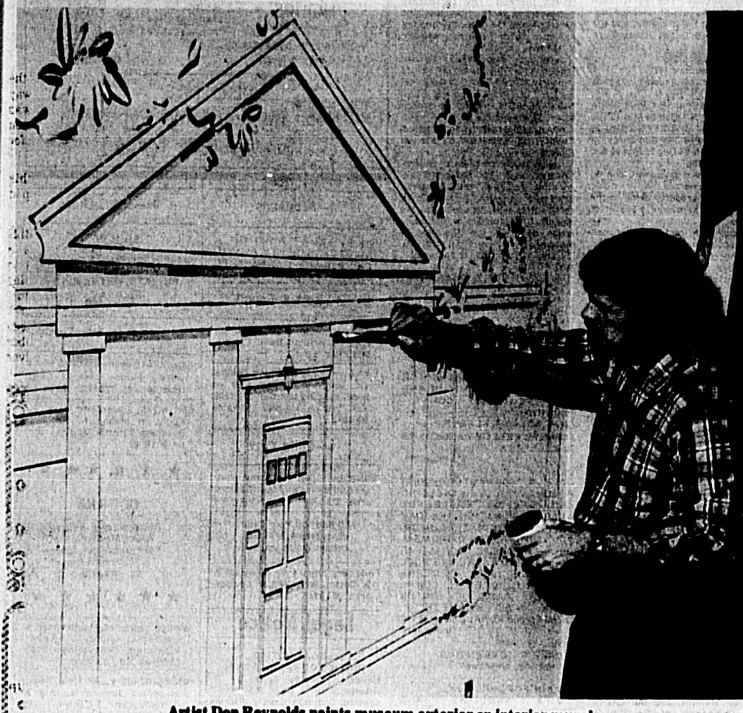
In And Around Sanford