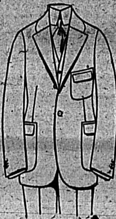
Here is one of the new 2-button sacks by Hart Schaffner & Marx

Yes, we want the world safe for democracy. But, most important of all, we want it safe for ourselves.