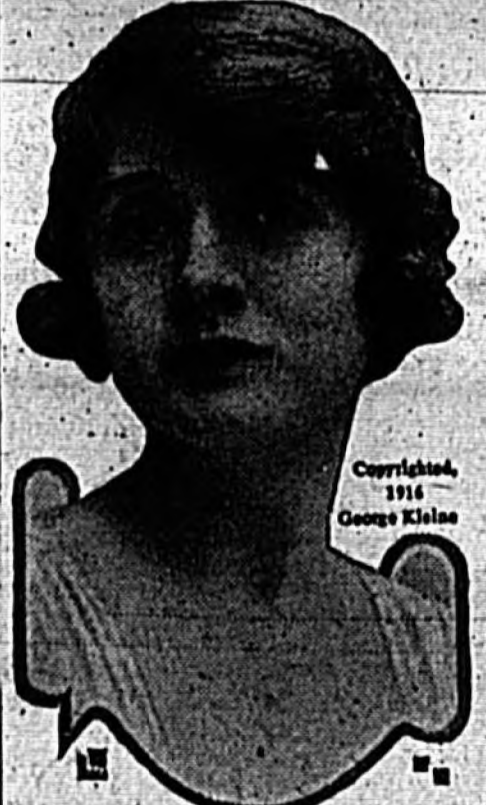
Miss Billie Burke LYRIC TUESDAY

The Lyric Orchestra Will Give Special Concerts Every Night