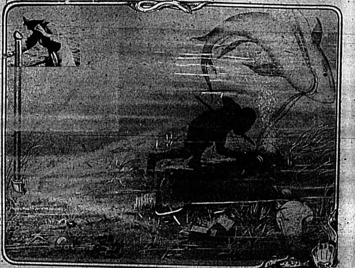
A SENSATIONAL THRILL STAGED AT THE BOTTOM OF THE SEA REVEALED BY "THE SUBMARINE EYE" LYRIC THEATRE SEPTEMBER 14th