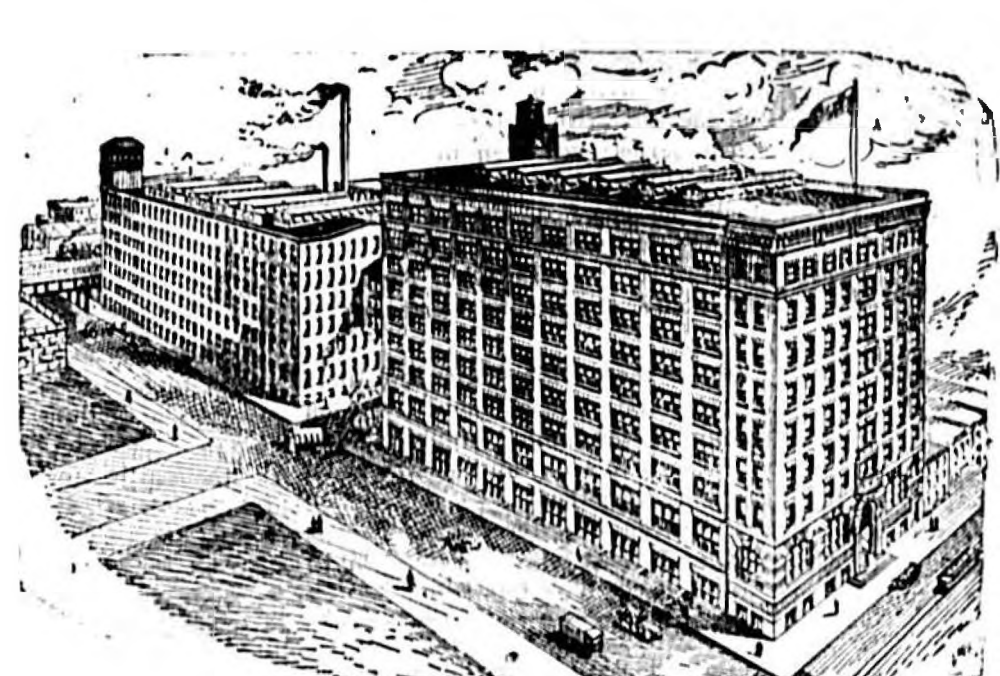
Main Offices and Factory of

"The Store that is Different" will save you money on your purchases.