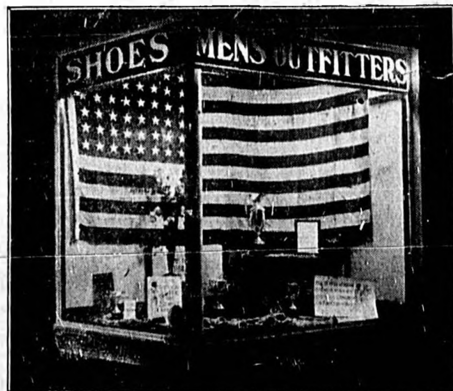
During the preparations for the Armistice Day celebration in Sanford the Legion boys left their prizes on exhibition in the windows of Perkins & Britt. The above picture was snapped by our photographer the night before Armistice day.