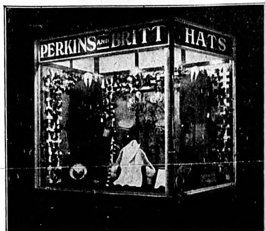
The above picture is that of one of Kenneth Murroll's pieces of window trimming art. Kenneth is a past master at the game and keeps a pair of the prettiest windows on First Street. He uses the proper lighting effects, too. Just glance at Perkins and Britt's show windows next time you are down town at night.