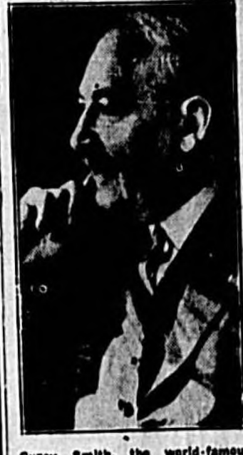
Gypsy Smith, the world-famous evangelist, is shown visiting in Atlanta, Ga., where he disclosed he has been invited to deliver the final address on Intercession Day at the coronation of King George VI of Great Britain. He spoke at the same occasion at the coronation of King George V 25 years ago.