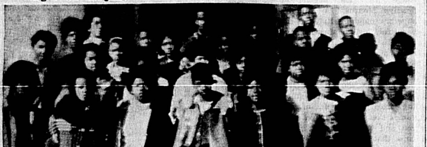
'Youthquake' Set Friday At Crooms High School.