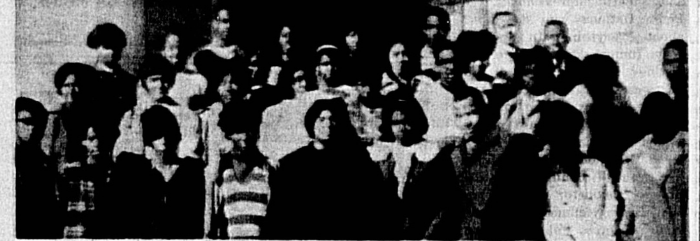
HOMEROOMS 12-2 (above) and 9-1 (below) at Crooms High School captured top honors in contributing food items for a bright Thanksgiving to the indigent.