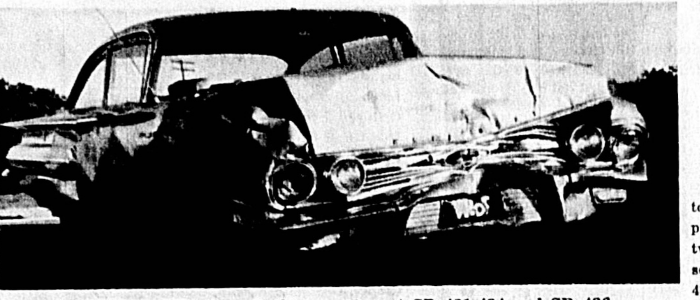
AFTERMATH of crash this morning at SR 431-434 and SR 486.