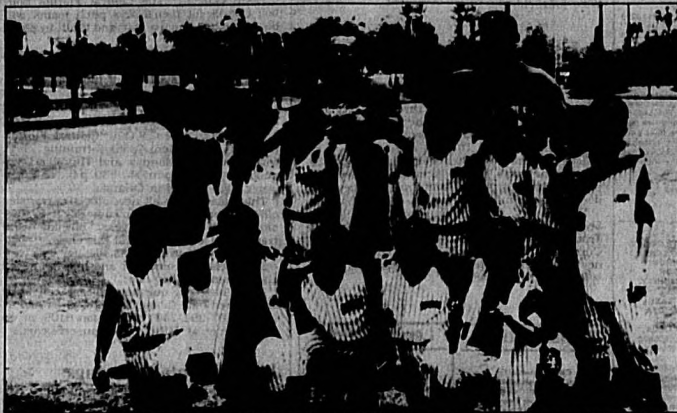
The 1988 nine-year-old AAU National Champion Central Florida Sun Devils