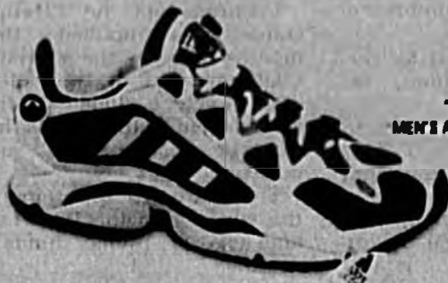
"THE WISH" MEN'S AND WOMEN'S RUNNING