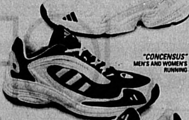
"CONCENSUS" MEN'S AND WOMEN'S RUNNING