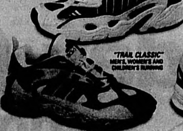
"TRAIL CLASSIC" MEN'S, WOMEN'S AND CHILDREN'S RUNNING