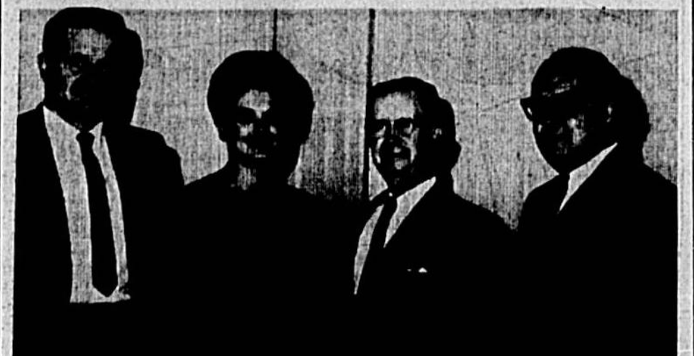
INCOMING OFFICERS of the Seminole County Unit of the American Cancer Society...