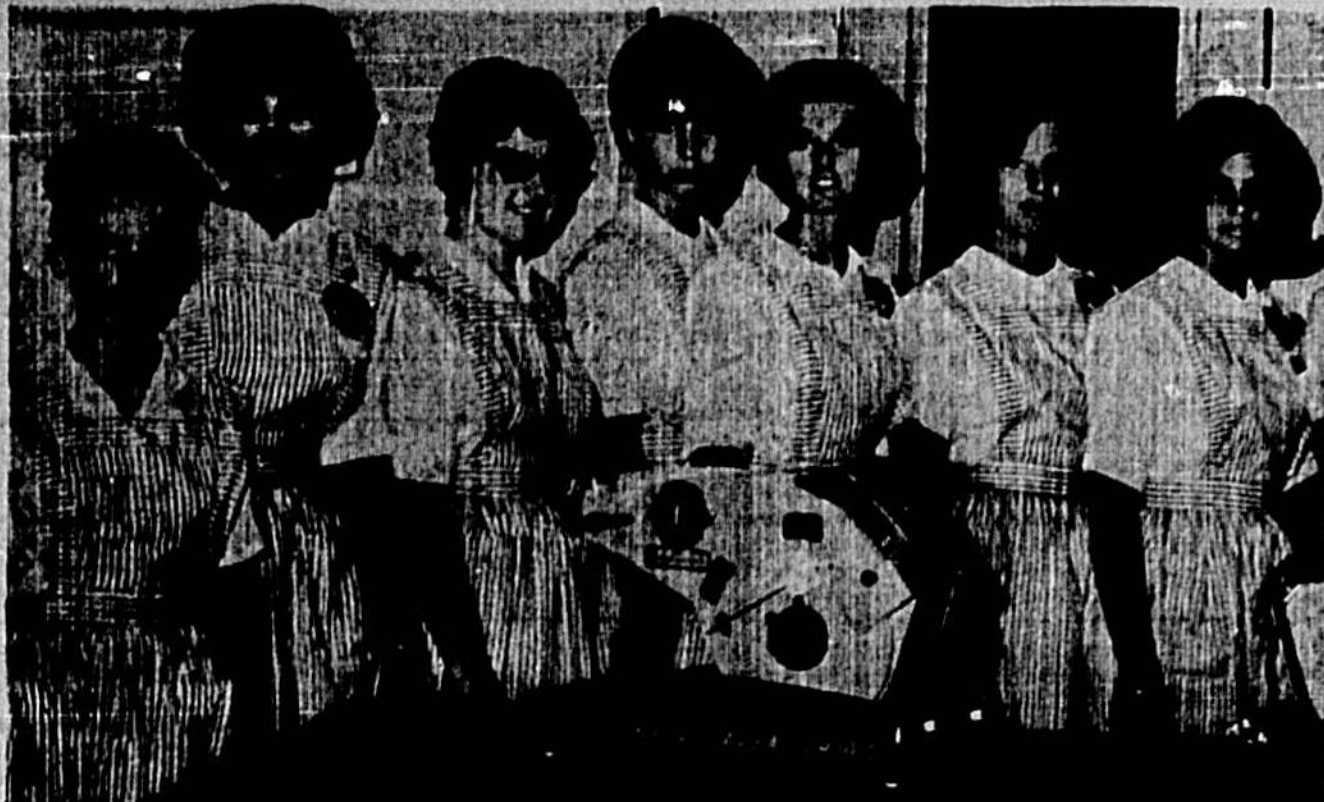
FREE EYE TESTING at the Lions Club Fair Monday will be conducted with the assistance of these Seminole Memorial Hospital ophthalmologists...

SERVICE DEPARTMENT 308 E. First St. Open 6 Days A Week