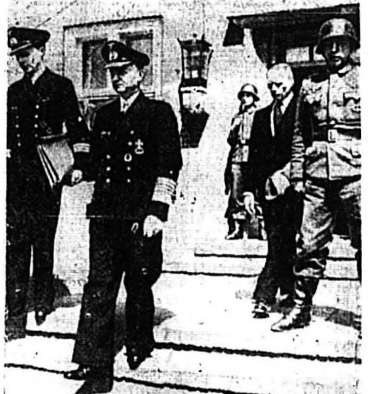
"PICTURED LEAVING HIS 'HEADQUARTERS' in Flensburg, Germany, Admiral Karl Doenitz (second from left) is accompanied by an aide and escorted by uniformed guards. Russia has protested the easy status of the self-named Fuehrer.